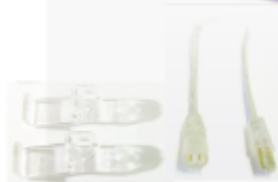
Clips and connectors